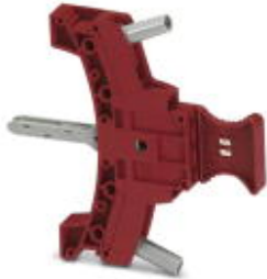
Test plug, Number of positions: 1, Width: 9 mm, Color: red

Please be informed that the data shown in this PDF Document is generated from our Online Catalog. Please find the complete data in the user's documentation. Our General Terms of Use for Downloads are valid ( http://phoenixcontact.com/download )