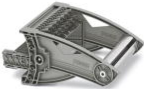
The figure shows the 14-pos. version

Test plug, Number of positions: 10, Width: 114.1 mm, Color: gray