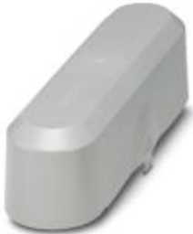
Cover, packed in pairs, length: 214 mm, width: 63 mm, height: 54.5 mm, color: gray

Please be informed that the data shown in this PDF Document is generated from our Online Catalog. Please find the complete data in the user's documentation. Our General Terms of Use for Downloads are valid ( http://phoenixcontact.com/download )