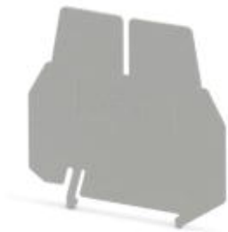
Separating plate, length: 66.5 mm, width: 1 mm, height: 62.5 mm, color: gray

Please be informed that the data shown in this PDF Document is generated from our Online Catalog. Please find the complete data in the user's documentation. Our General Terms of Use for Downloads are valid ( http://phoenixcontact.com/download )