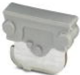
Spare knife, Length: 10.5 mm, Width: 4 mm, Color: gray