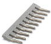
Insertion bridge, Number of positions: 10, Color: gray