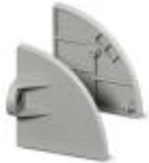
Flange cover, Color: gray