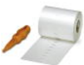
Marker for terminal blocks, Roll, white, Unlabeled, Can be labeled with: THERMOMARK ROLL, THERMOMARK X, THERMOMARK S1.1, Unperforated, Mounting type: Snap into universal marker groove, Snap into flat marker groove, Lettering field: 6.35 x 101.5 mm

Marker for terminal blocks - TMT 100 R - 0816605