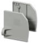
Flange cover, Color: gray