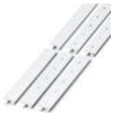
Zack marker strip, Strip, white, Unlabeled, Can be labeled with: Plotter, Mounting type: Snap into tall marker groove, For terminal block width: 20.3 mm, Lettering field: 10.5 x 20.25 mm

Zack marker strip - ZB 20,3:UNPRINTED - 0820248