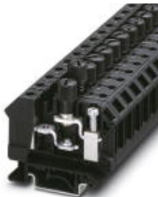
Fuse terminal block for cartridge fuse insert, cross section: 0.5 - 16 mm 2 , AWG: 24 - 6, width: 12 mm, color: black

Please be informed that the data shown in this PDF Document is generated from our Online Catalog. Please find the complete data in the user's documentation. Our General Terms of Use for Downloads are valid ( http://phoenixcontact.com/download )