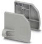
Flange cover, Color: gray