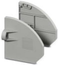
Flange cover, Number of positions: 0, Color: gray

Please be informed that the data shown in this PDF Document is generated from our Online Catalog. Please find the complete data in the user's documentation. Our General Terms of Use for Downloads are valid ( http://phoenixcontact.com/download )