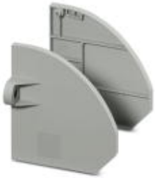
Flange cover, Number of positions: 0, Color: gray

Please be informed that the data shown in this PDF Document is generated from our Online Catalog. Please find the complete data in the user's documentation. Our General Terms of Use for Downloads are valid ( http://phoenixcontact.com/download )