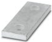
Connection rail, number of positions: 2, color: silver