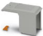
Covering hood, length: 144 mm, width: 41 mm, height: 33 mm, color: gray