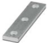
Connection rail, number of positions: 3, color: silver