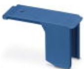
Covering hood, length: 144 mm, width: 41 mm, height: 33 mm, color: blue