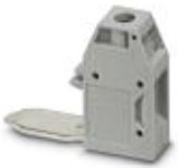
Pick-off terminal block, Connection method: Screw connection, Cross section: 0.5 mm 2 - 10 mm 2 , AWG: 20 - 8, Width: 10.2 mm, Height: 34.7 mm, Color: gray, Mounting type: On base element

Pick-off terminal block - AGK 10-UKH 50 - 3001763