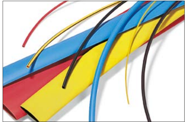
TF21 – available in a wide range of colours and sizes.