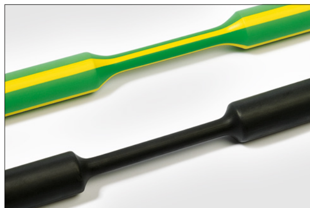
TREDUX shrinks a maximum of 3:1.