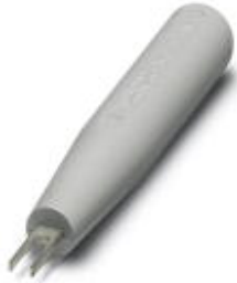
Contact removal tool

Please be informed that the data shown in this PDF Document is generated from our Online Catalog. Please find the complete data in the user's documentation. Our General Terms of Use for Downloads are valid ( http://phoenixcontact.com/download )