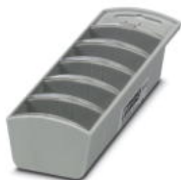
Range box, unequipped, color: light gray

Please be informed that the data shown in this PDF Document is generated from our Online Catalog. Please find the complete data in the user's documentation. Our General Terms of Use for Downloads are valid ( http://phoenixcontact.com/download )