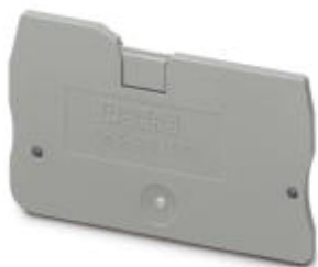
End cover, length: 53.5 mm, width: 2.2 mm, height: 39.3 mm, color: gray

Please be informed that the data shown in this PDF Document is generated from our Online Catalog. Please find the complete data in the user's documentation. Our General Terms of Use for Downloads are valid ( http://phoenixcontact.com/download )