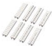
Zack marker strip, Can be ordered: Strip, white, Labeled according to customer specifications, Mounting type: Snap into tall marker groove, For terminal block width: 5.2 mm, Lettering field: 5.15 x 10.5 mm