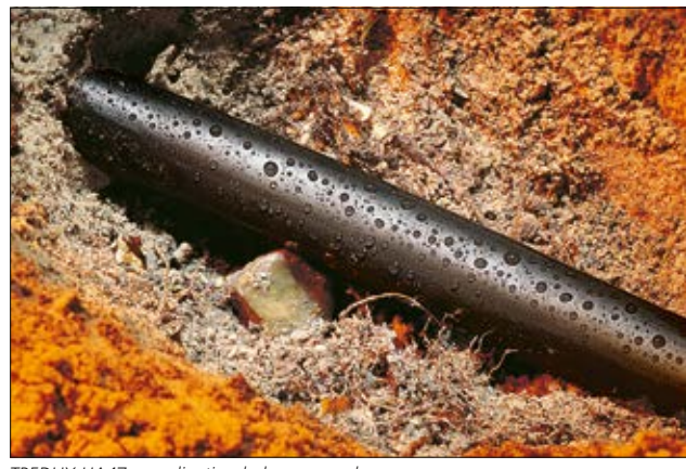
TREDUX HA47 - application below ground.