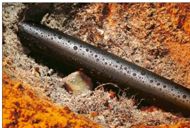
TREDUX HA47 - application below ground.