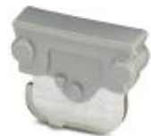
Feed-through connector, Length: 10.5 mm, Width: 4 mm, Color: gray

Feed-through connector - P-FIX - 3038956