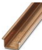
DIN rail, material: Copper, unperforated, 1.5 mm thick, height 15 mm, width 35 mm, length: 2 m

DIN rail, unperforated - NS 35/15 CU UNPERF 2000MM - 1201895