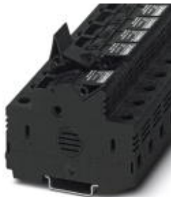
Fuse terminal block with light indicator, for cartridge fuse insert 10.3 x 38 mm, cross section: 1.5 - 25 mm 2 , AWG: 16 - 4, width: 18 mm, color: Black

Please be informed that the data shown in this PDF Document is generated from our Online Catalog. Please find the complete data in the user's documentation. Our General Terms of Use for Downloads are valid ( http://phoenixcontact.com/download )