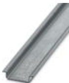
DIN rail, material: Galvanized, unperforated, height 7.5 mm, width 35 mm, length: 2 m

DIN rail, unperforated - NS 35/ 7,5 ZN UNPERF 2000MM - 1206434