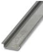
DIN rail, unperforated, Width: 35 mm, Height: 7.5 mm, Length: 2000 mm, Color: silver

DIN rail, unperforated - NS 35/ 7,5 AL UNPERF 2000MM - 0801704