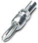
Test plugs, Color: silver