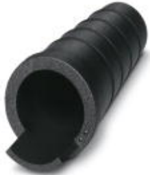
Bend protection sleeve, for cable diameter of 4 mm ... 12 mm, diameter: 12 mm, color: black

Please be informed that the data shown in this PDF Document is generated from our Online Catalog. Please find the complete data in the user's documentation. Our General Terms of Use for Downloads are valid ( http://phoenixcontact.com/download )