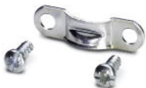
Strain relief clamp

Please be informed that the data shown in this PDF Document is generated from our Online Catalog. Please find the complete data in the user's documentation. Our General Terms of Use for Downloads are valid ( http://phoenixcontact.com/download )