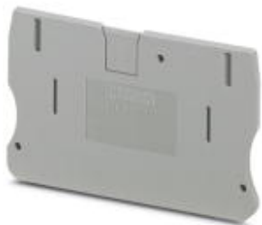
End cover, length: 67.7 mm, width: 2.2 mm, height: 42.6 mm, color: gray

Please be informed that the data shown in this PDF Document is generated from our Online Catalog. Please find the complete data in the user's documentation. Our General Terms of Use for Downloads are valid ( http://phoenixcontact.com/download )