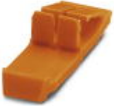
Latching, Color: orange