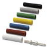
Insulating sleeve, Color: red