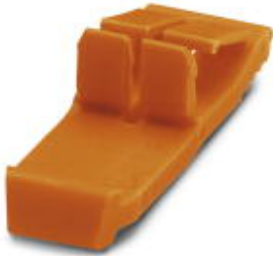
Latching, length: 28.9 mm, width: 6.8 mm, number of positions: 2, color: orange

Please be informed that the data shown in this PDF Document is generated from our Online Catalog. Please find the complete data in the user's documentation. Our General Terms of Use for Downloads are valid ( http://phoenixcontact.com/download )