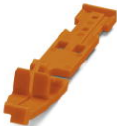
Latching, length: 59 mm, width: 6.8 mm, color: orange

Please be informed that the data shown in this PDF Document is generated from our Online Catalog. Please find the complete data in the user's documentation. Our General Terms of Use for Downloads are valid ( http://phoenixcontact.com/download )