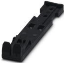
Strain relief, length: 44.5 mm, width: 6.8 mm, number of positions: 2, color: black

Please be informed that the data shown in this PDF Document is generated from our Online Catalog. Please find the complete data in the user's documentation. Our General Terms of Use for Downloads are valid ( http://phoenixcontact.com/download )