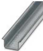
DIN rail, material: Galvanized, unperforated, height 15 mm, width 35 mm, length: 2 m

DIN rail - NS 35/15 ZN UNPERF 2000MM - 1206586