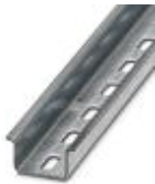
DIN rail, material: Galvanized, perforated, height 15 mm, width 35 mm, length: 2 m

DIN rail - NS 35/15 ZN PERF 2000MM - 1206599