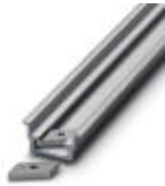
DIN rail, deep drawn, high profile, unperforated, 1.5 mm thick, material: aluminum, height 15 mm, width 35 mm, length 2000 mm

DIN rail, unperforated - NS 35/15 AL UNPERF 2000MM - 1201756