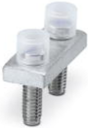
Fixed bridge, pitch: 20 mm, number of positions: 2, color: silver

Please be informed that the data shown in this PDF Document is generated from our Online Catalog. Please find the complete data in the user's documentation. Our General Terms of Use for Downloads are valid ( http://phoenixcontact.com/download )