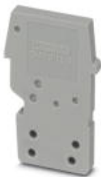
End cover, length: 17.8 mm, width: 3 mm, height: 27 mm, color: gray

Please be informed that the data shown in this PDF Document is generated from our Online Catalog. Please find the complete data in the user's documentation. Our General Terms of Use for Downloads are valid ( http://phoenixcontact.com/download )