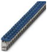
Connection terminal block, Connection method Screw connection, Load current : 125 A, Cross section: 2.5 mm 2 - 35 mm 2 , Width: 14.3 mm, Color: blue

Connection terminal block - AKG 35 BU - 0424013