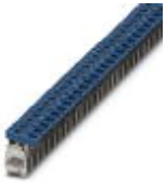
Connection terminal block, Connection method Screw connection, Load current : 76 A, Cross section: 1.5 mm 2 - 16 mm 2 , Width: 9.8 mm, Color: blue

Connection terminal block - AKG 16 BU - 0423014