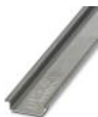
DIN rail, unperforated, Width: 35 mm, Height: 7.5 mm, Length: 2000 mm, Color: silver

DIN rail, unperforated - NS 35/ 7,5 AL UNPERF 2000MM - 0801704