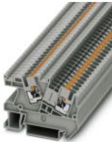
Installation terminal block, Push-in connection, Cross section: 0.14 mm 2 - 4 mm 2 , AWG: 26 - 12, Width: 5.2 mm, Color: gray, Mounting type: NS 35/7,5, NS 35/15

Please be informed that the data shown in this PDF Document is generated from our Online Catalog. Please find the complete data in the user's documentation. Our General Terms of Use for Downloads are valid ( http://download.phoenixcontact.com )