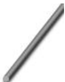
Connection pin, Length: 1000 mm, Color: gray