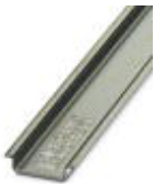
DIN rail, material: Steel, unperforated, height 7.5 mm, width 35 mm, length: 2 m

DIN rail, unperforated - NS 35/ 7,5 UNPERF 2000MM - 0801681