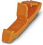
Latching, Color: orange