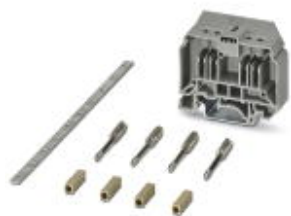
Short-circuit kit for current transformer. Use with DIN rail mounted RBO/RSC 5 feed-through terminals

Please be informed that the data shown in this PDF Document is generated from our Online Catalog. Please find the complete data in the user's documentation. Our General Terms of Use for Downloads are valid ( http://phoenixcontact.com/download )