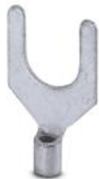
Fork-type cable lug, non-insulated, 1.1 - 2.5 mm 2 , M8

Please be informed that the data shown in this PDF Document is generated from our Online Catalog. Please find the complete data in the user's documentation. Our General Terms of Use for Downloads are valid ( http://phoenixcontact.com/download )