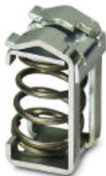
Shield connection terminal block, for applying the shield to busbars

Please be informed that the data shown in this PDF Document is generated from our Online Catalog. Please find the complete data in the user's documentation. Our General Terms of Use for Downloads are valid ( http://phoenixcontact.com/download )