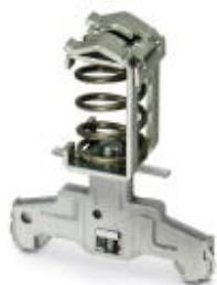
Shield connection terminal block, for applying the shield to busbars

Please be informed that the data shown in this PDF Document is generated from our Online Catalog. Please find the complete data in the user's documentation. Our General Terms of Use for Downloads are valid ( http://phoenixcontact.com/download )