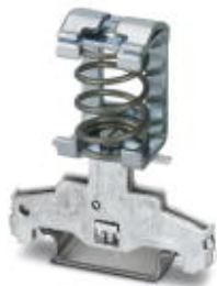
Shield connection terminal block, for applying the shield to busbars

Please be informed that the data shown in this PDF Document is generated from our Online Catalog. Please find the complete data in the user's documentation. Our General Terms of Use for Downloads are valid ( http://phoenixcontact.com/download )