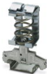
Shield connection terminal block, for applying the shield to busbars

Please be informed that the data shown in this PDF Document is generated from our Online Catalog. Please find the complete data in the user's documentation. Our General Terms of Use for Downloads are valid ( http://phoenixcontact.com/download )