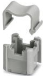
Support bracket for busbars

Please be informed that the data shown in this PDF Document is generated from our Online Catalog. Please find the complete data in the user's documentation. Our General Terms of Use for Downloads are valid ( http://phoenixcontact.com/download )