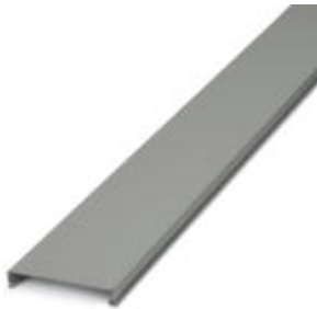
Cover for cable duct, gray, width: 40 mm, length: 2000 mm

Please be informed that the data shown in this PDF Document is generated from our Online Catalog. Please find the complete data in the user's documentation. Our General Terms of Use for Downloads are valid ( http://download.phoenixcontact.com )